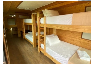
CENDERAWASIH DELUXE/ DOMITORY