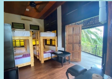
KENARI DELUXE/ DOMITORY